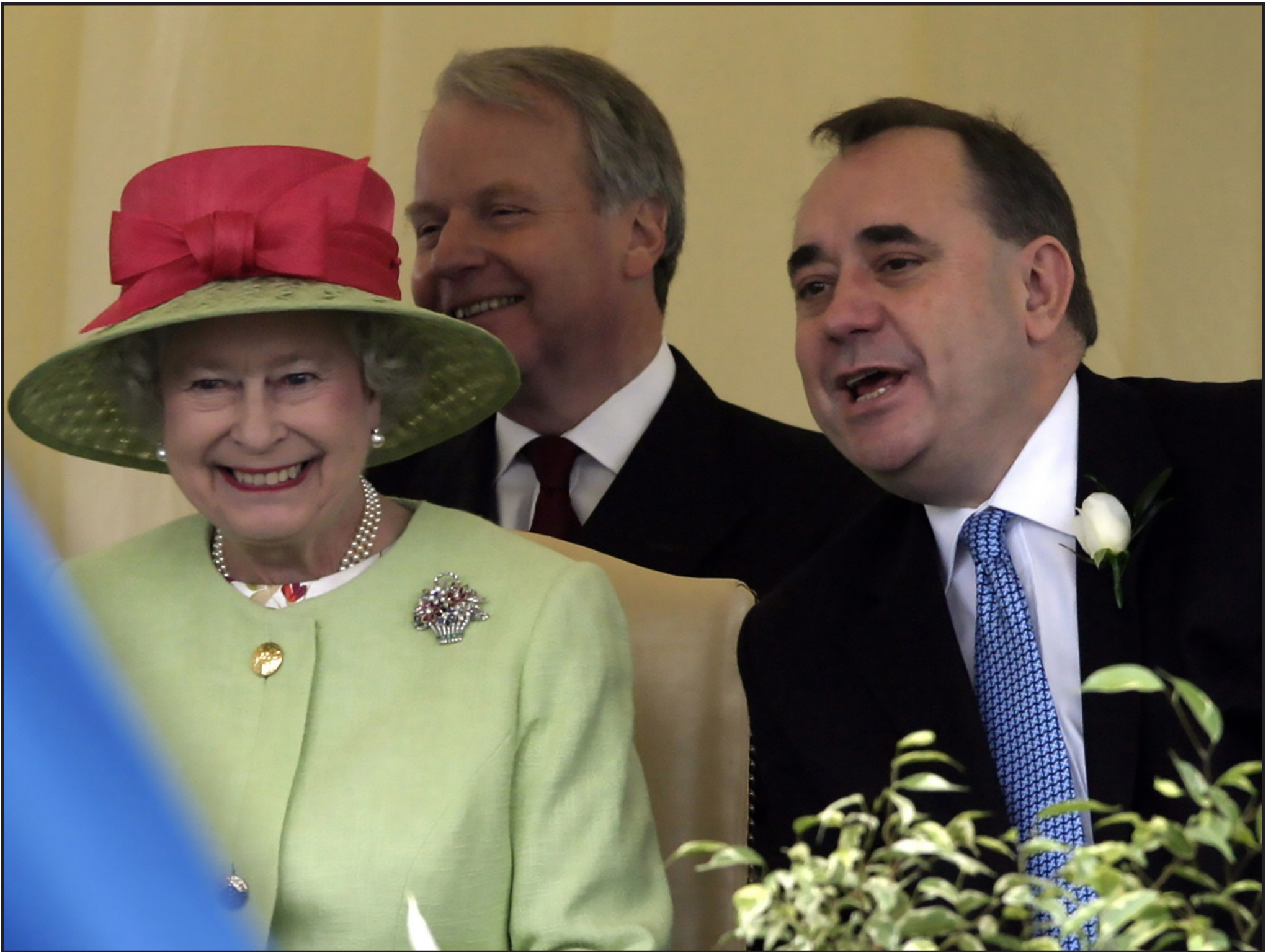
He came to accept Nato, the monarchy and even keeping sterling