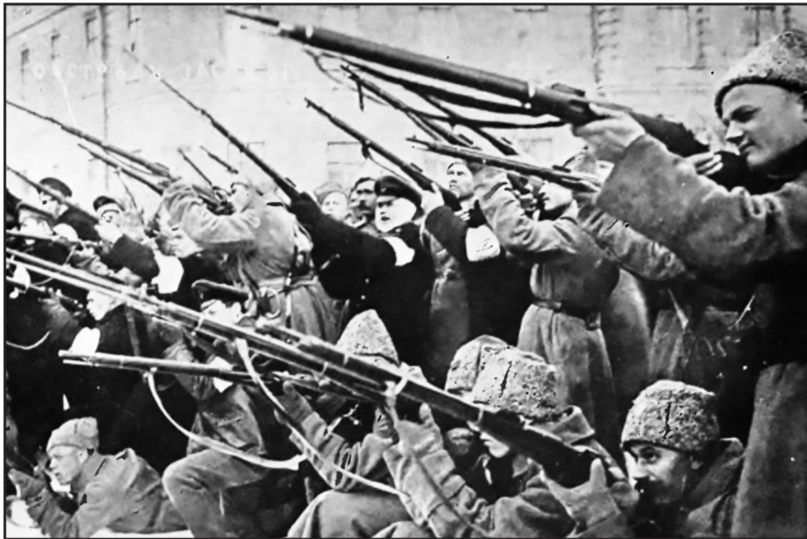
After February 1917 the Bolsheviks dropped 'revolutionary defeatism'

Either way, it needs to be understood that, whatever is in the head of a particular proposer, those authorised to action any such proposition can do with it as they see fit - as long as they are ultimately accountable. Proposers, especially when it comes to a passing verbal