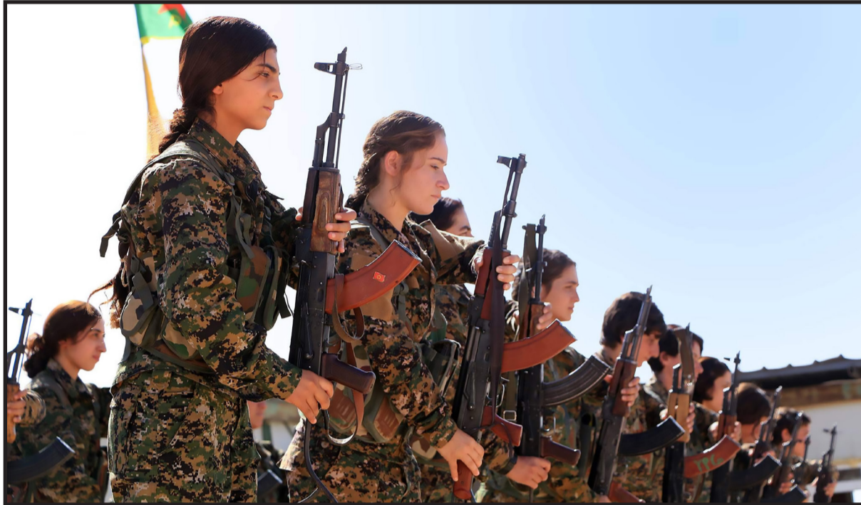
Kurdish YPG fighters in Syria

As Turkey's influence in the region diminishes, Iranian influence would inevitably increase. This could have profound implications for US policy in the region. While the USA is pushing for more centralisation and consolidation of the position of the Autonomous Administration of North and East Syria (Rojava) in Syria, Rojava could also continue its old policy of forming a centralised organisation by bringing together different militias. This would affect the positions of the Kurdistan Workers Party (PKK) and