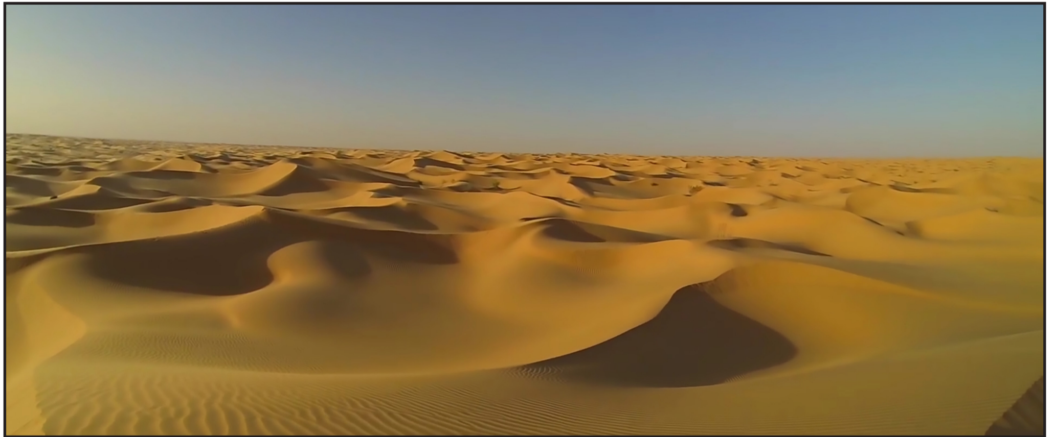
Future of the American wheat belt?