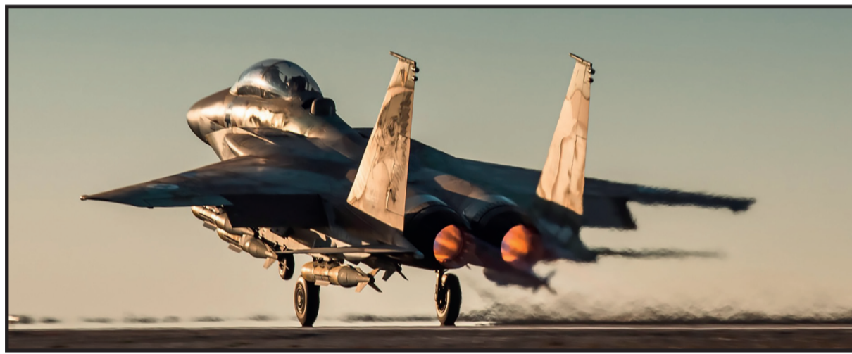
US-manufactured Israeli F-15s: used to pound south Lebanon

After a couple of weeks of speculation about the timing and nature of the Israeli retaliation against Iran, US media reported