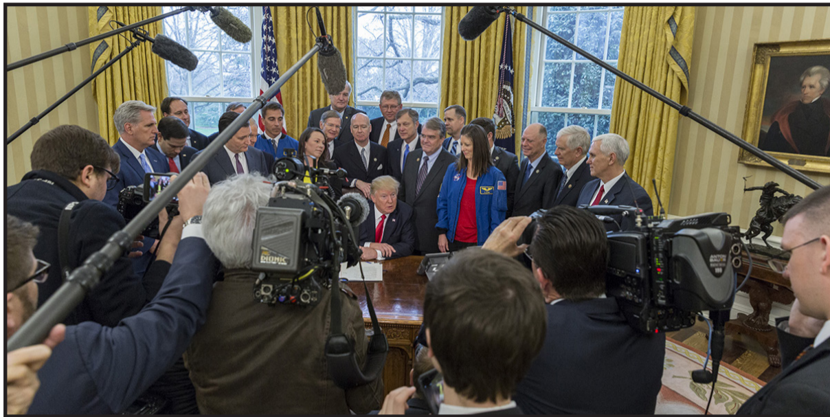
The once and future president?