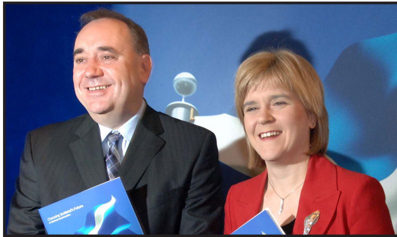
Alex Salmond and Nicola Sturgeon: lucky, not brilliant

If we ask why Yousaf broke the coalition agreement, the answer seems to be that the Greens were likely to abandon it themselves after a consultation with their membership, in the light of the SNP's abandonment on April 18 of its 'net zero' target of a 75% reduction in carbon emissions by 2030. By taking the initiative, Yousaf at least may have expected to get control of the timing, and perhaps may also have hoped to 'face down' the Green MSPs and force them to accept a coalition deal without either the carbon emissions target or the bottle and can recycling scheme, already abandoned in the face of packaging companies' lobbying at Westminster. Behind the decision to abandon the targets was the March 20 announcement by the