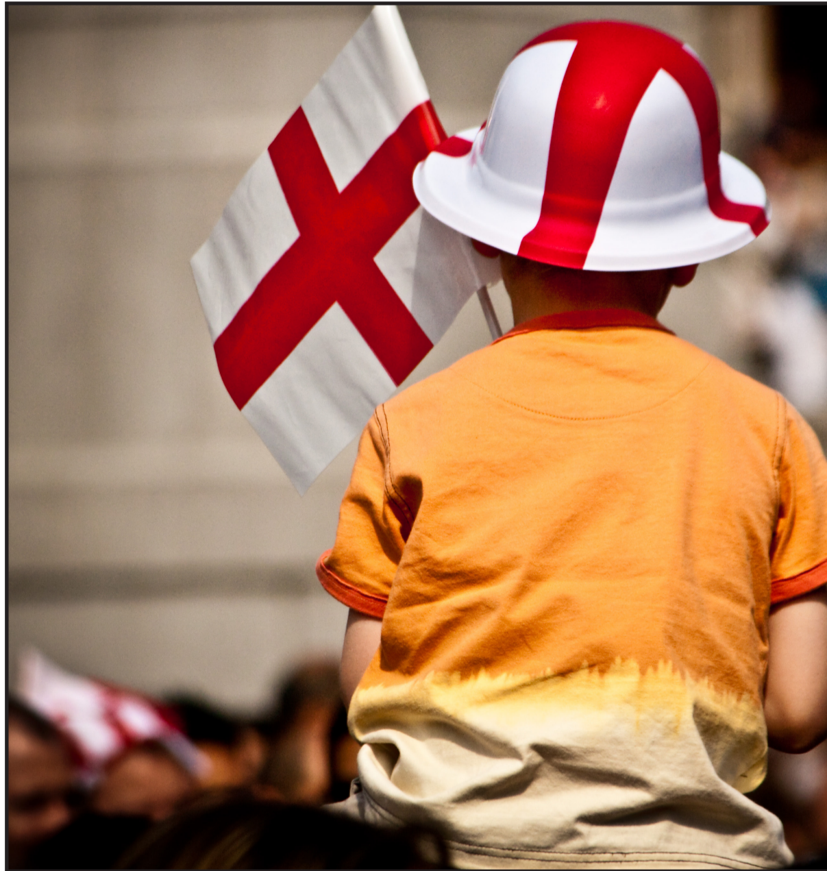
St George's Day: nation, not class

A recent Guardian article claimed that Sir Keir Starmer had written to parliamentary candidates, demanding they mark St George's Day "with enthusiasm" and "fly the flag" 4 . As many on the left noted, this was an attempt to conform to what the ruling class has decided should be a