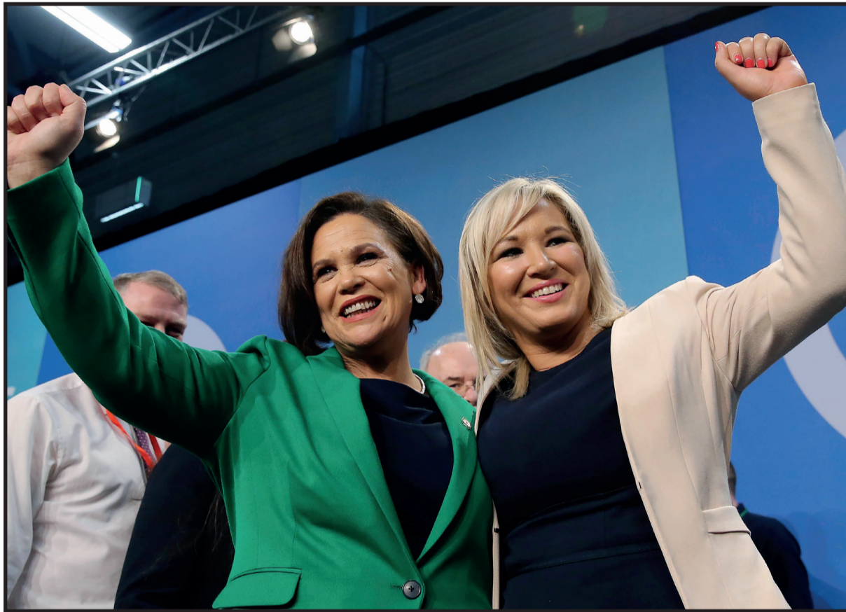
Mary Lou McDonald and Michelle O'Neill

In contrast, O'Neill made a far more conciliatory speech, presenting herself as a first minister for both republicans and unionists, and making it clear that, as far as she was concerned, the institutionalised inequality on which the statelet was founded has been eclipsed. She declared: "Yesterday is gone. My appointment reflects that change." As a Catholic and republican