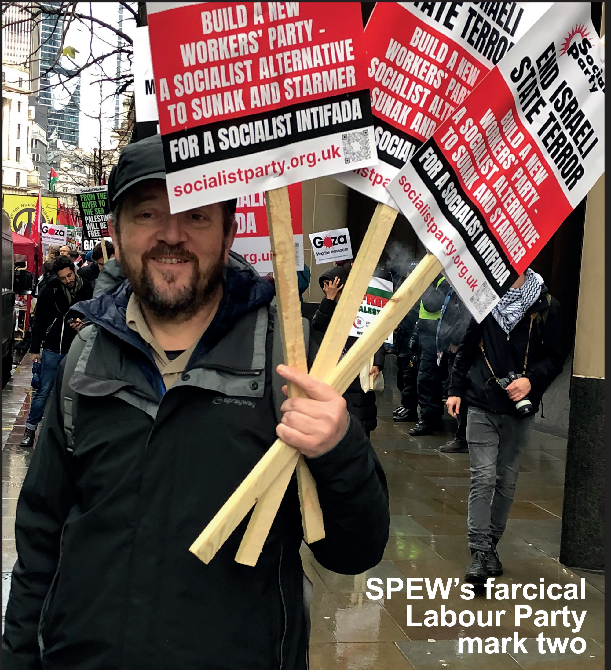
SPEW's farcical Labour Party mark two