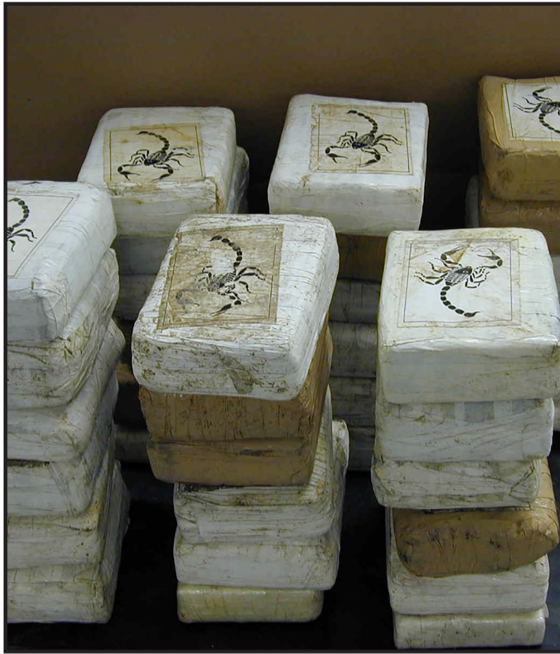
Bricks of cocaine: a form in which it is commonly transported

“Fifty years into the world ‘war on drugs’, the drugs are winning,” a health-policy journal observes. 4 So, again, why do governments stick with