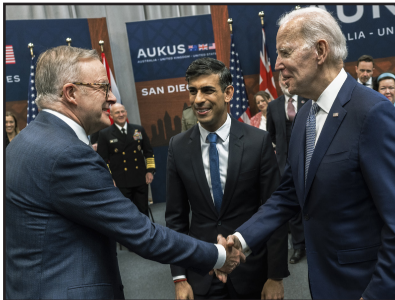
Anthony Albanese at AUKUS meeting on March 13 2023