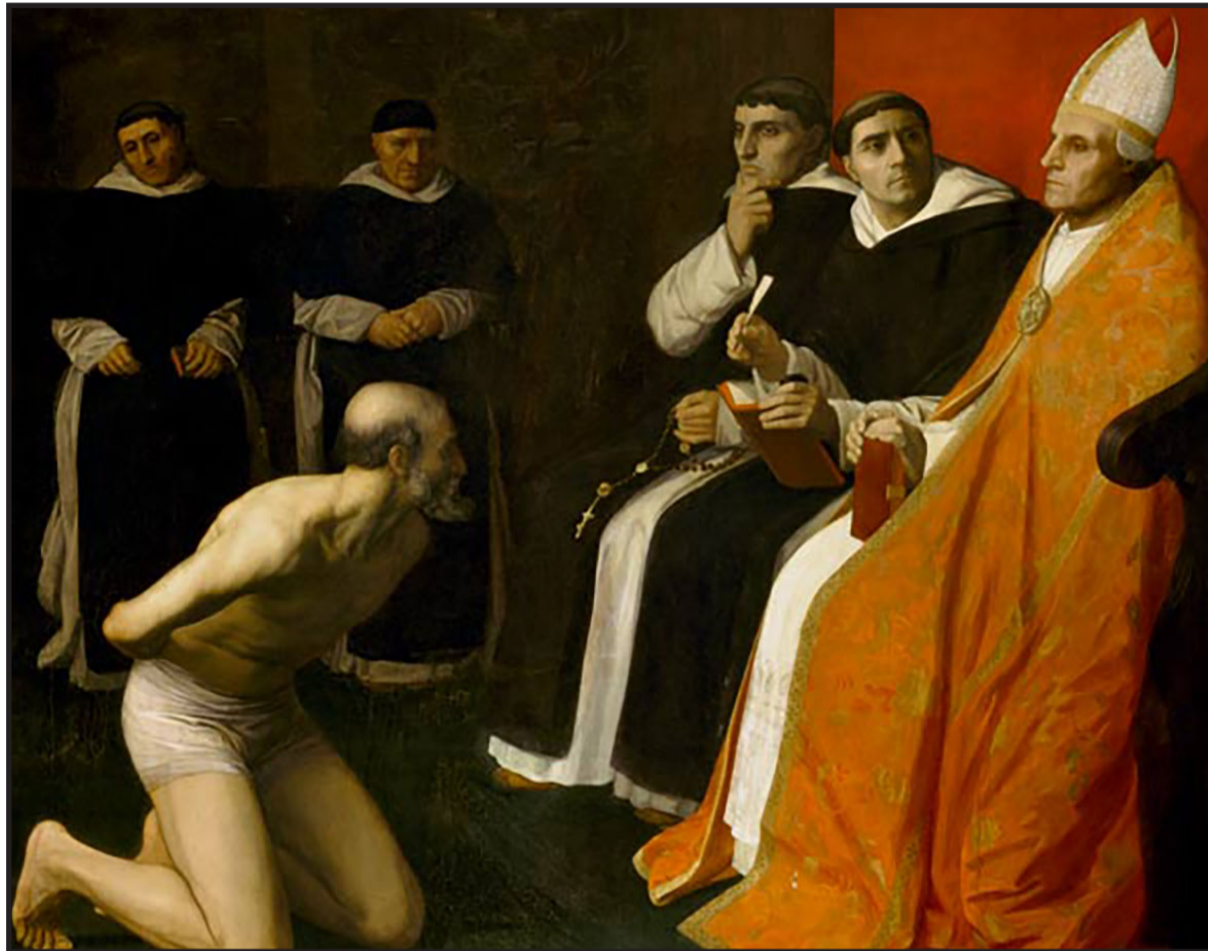
Alphonse Legros 'An apology' 1868

It is quite apparent though that Osamor did not equate Gaza with the Nazi genocide - she did not say that the