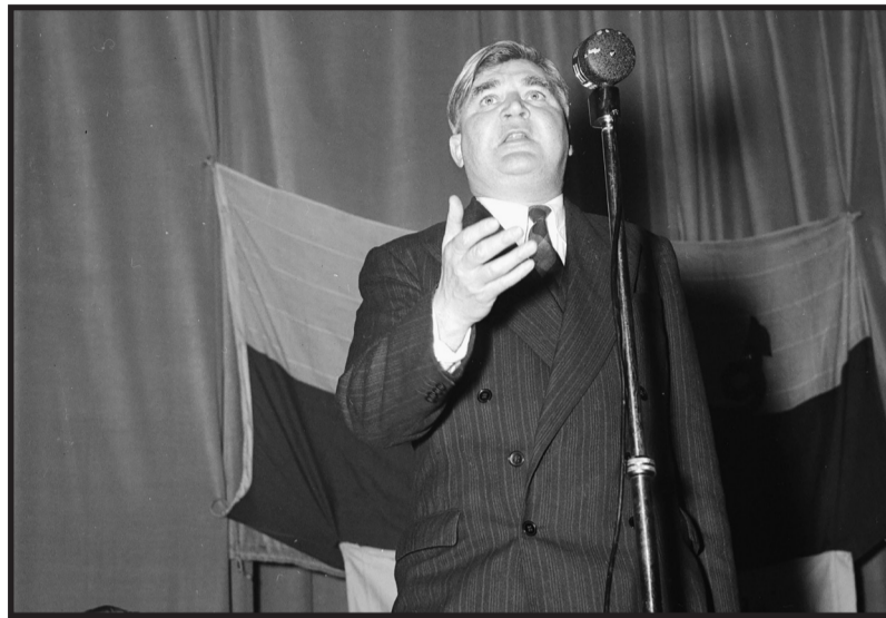
Aneurin Bevan: turning in his grave?

Anyone looking at the way the government has handled the compensation payments to those who have been harmed by the Post Office