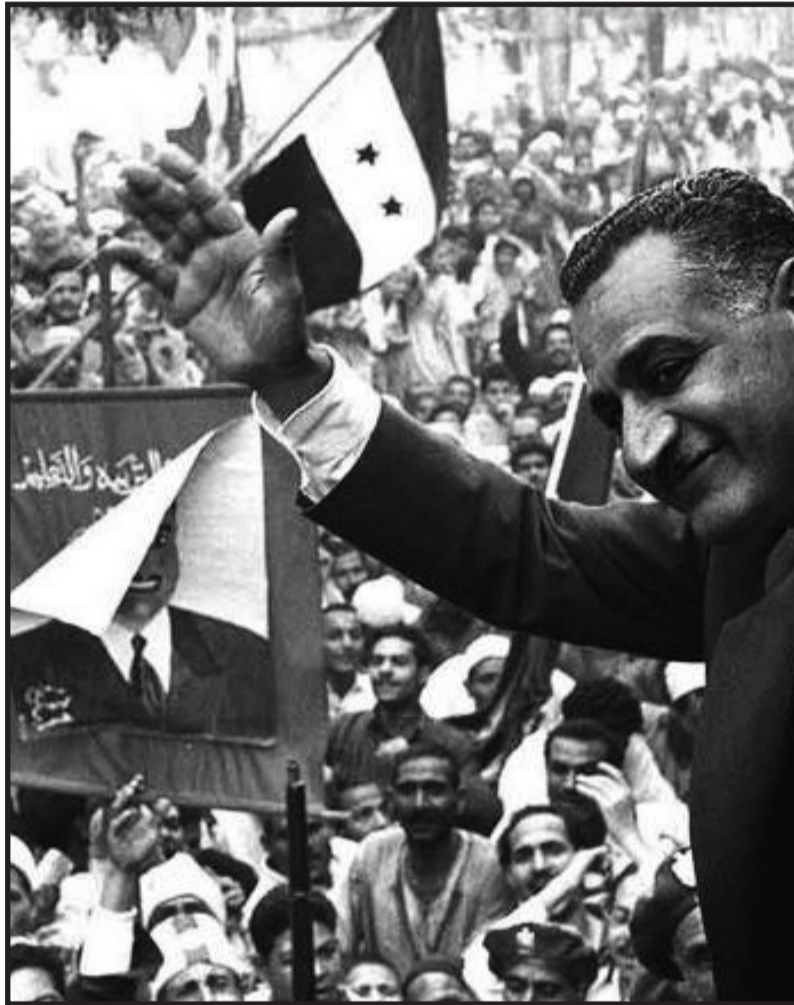
Nasser waving to crowd in Mansoura, 1960

In the same period, French investors financed the construction of the Suez Canal, connecting the Mediterranean to the Red Sea. As khedive (ruler), Isma'il Pasha sold Egypt's shares in the Suez Canal Company to Britain in 1875 due to a financial crisis. Growing discontent with European and Ottoman influence in Egypt culminated in a nationalist revolt in 1879. In response, the British occupied