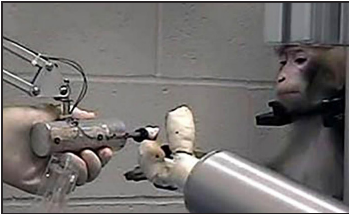
Monkey operating a robotic arm with brain-computer interface

Perhaps, perhaps ... We are unsurprisingly a lot closer to the first of those, where the desired outputs are relatively simpler. There are major technical challenges at both ends of the pipeline: creating sensors that can be safely and durably integrated with the human brain, yet still be close enough to the action to reliably pick up electrical signals sometimes measured in the microvolts, is a formidable difficulty. Interpreting an endless stream of electrical signals and mapping them onto human intent is another one. There is a great deal of excitement about advances in machine learning (ML), and what that might be able to do on the output